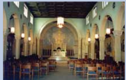
Holy Family Chapel