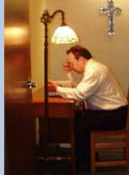
Individual prayer and study rooms.

We welcome individuals from all faith traditions. Our mission calls us to encourage individuals to grow spiritually through developing a deeper sense of reverence in relationship to self, others, nature, Earth and God.